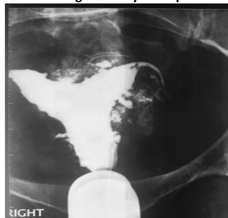
Fig 6: HSG - Adenomyosis with B/L Tubal Blockage