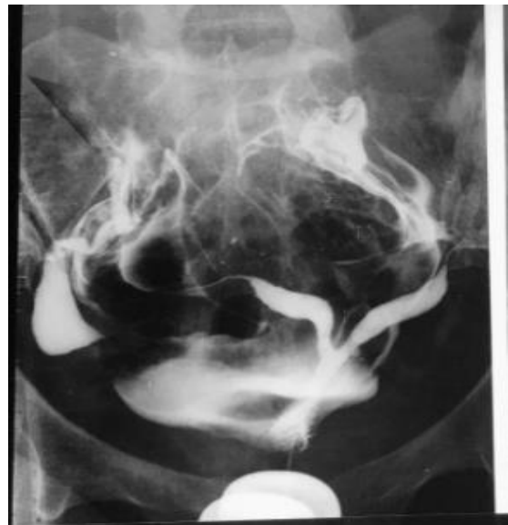
Fig 8: HSG - Septate Uterus