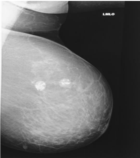
Fig 1: Mammogram-Small Calcified Fibroadenoma