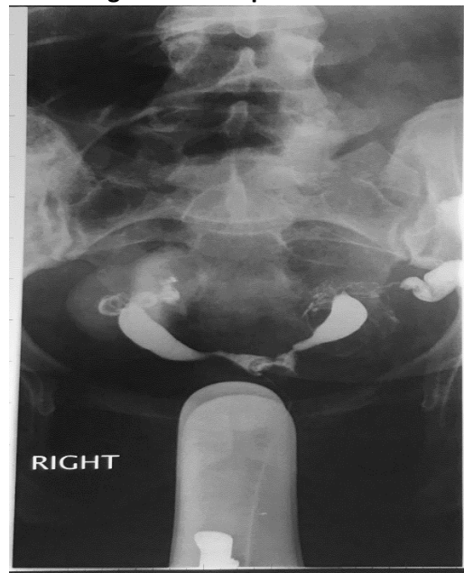
Fig 10: HSG - Bicornuate Bicollis