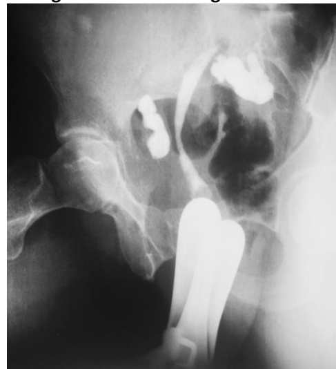
Fig 4: HSG-Uterine Fibroid And B/L Tubal Blockage with Hydrosalpinx