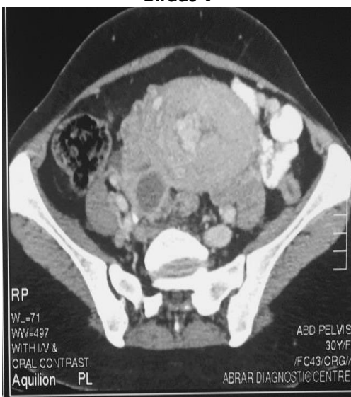
Fig 11: CT - Hydatiform Mole