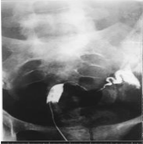
Fig 5: HSG - Unicornuate Uterus