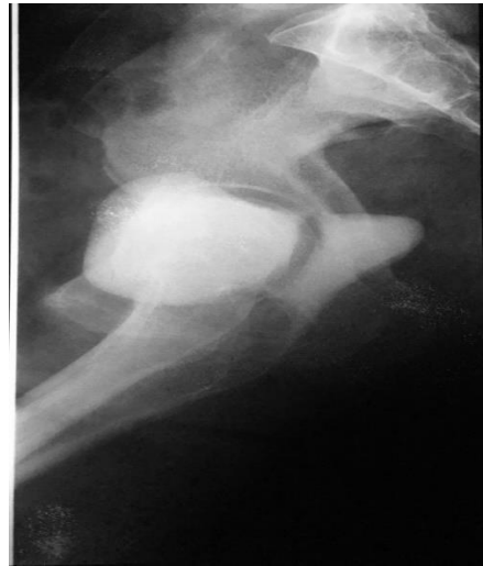
Fig 2: HSG - Vesicovaginal Fistula